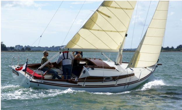
Olceni 2, Toulinguet home built by Jean-Marc Gillocoq

Toulinguet is a classic yacht of reasonable size, easy to handle and well suited for coastal cruising and even more.