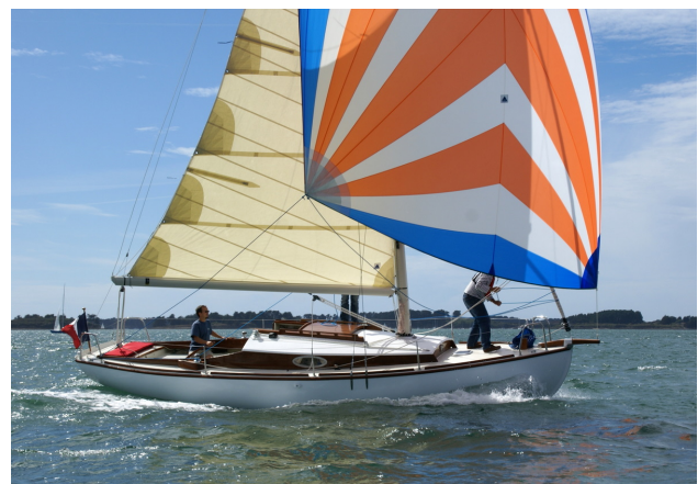
Toulinguet under asymmetric spinnaker. A symmetric spinnaker is also possible.

The rig, with a large mainsail, a masthead jumper and a moderately sized genoa allows the crew to tack easily and gives a lot of pleasure when sailing close to the coast. A roller reefing system may be fitted for the genoa. Mast and spars are anodised aluminium standard profiles and may be painted to give a more traditional appearance.