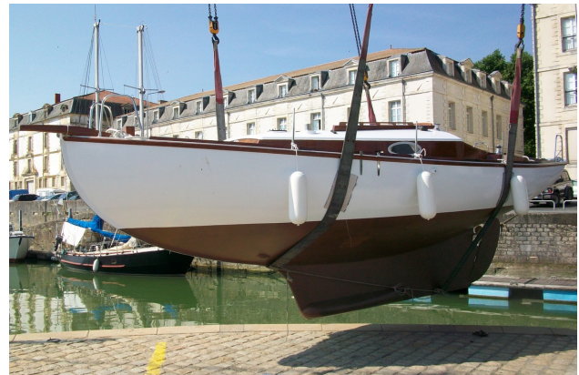
The long keel allows easy drying out. It is thin and fitted with a lead bulb, making the hull very efficient under sail.

which distinguishes classic yachts : sensible steering, good course keeping, ability to manoeuvre under sail, soft motion at sea... The long keel, with a lead ballast, contribute to that and allows Toulinguet to dry out easily on its legs. It makes also excellent windward ability.