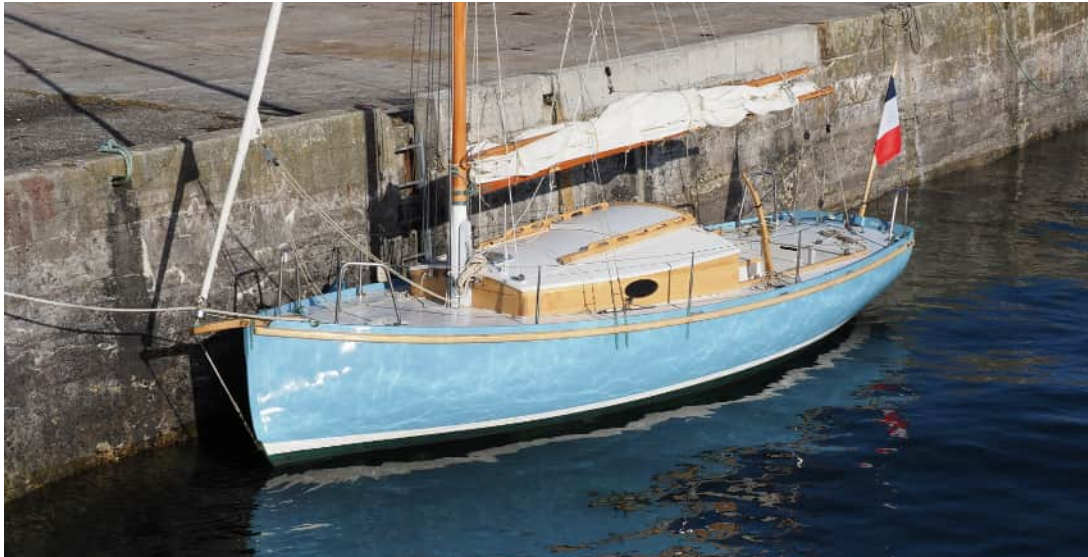
Pen-Hir #1 à Molène