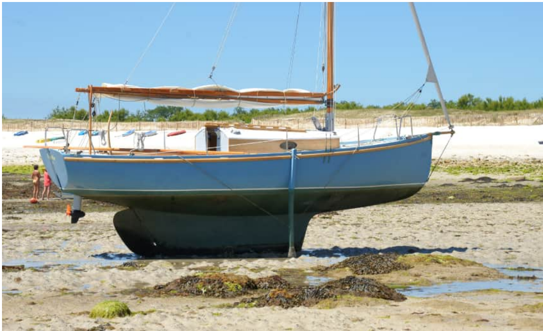
Pen-Hir #1 béquillage à Hoedic