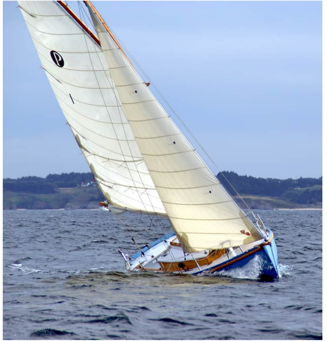
Pen-Hir #1 sous voile