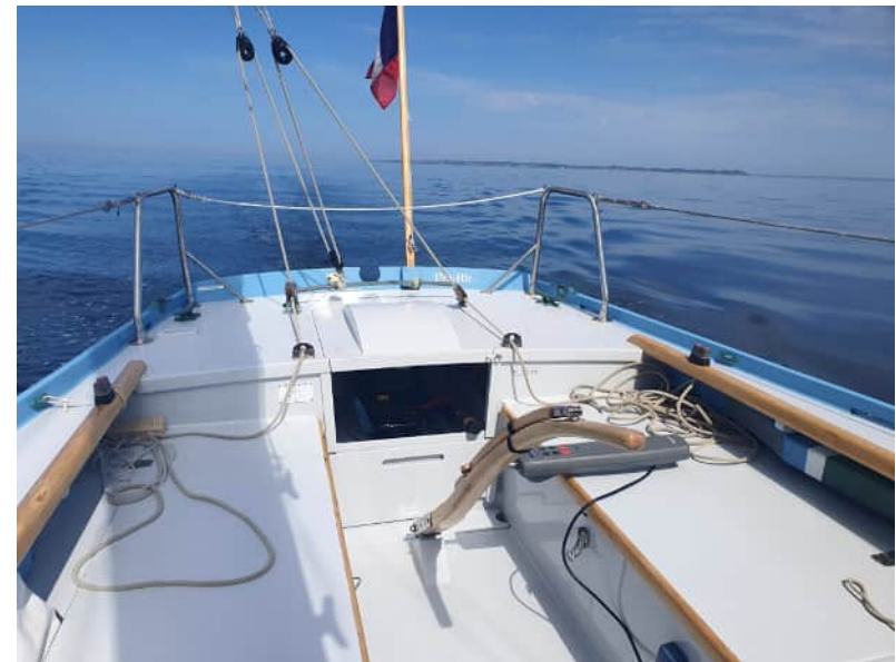
Pen-Hir #1 avec son nouveau moteur thermique 6 ch Cockpit repeint en 2024