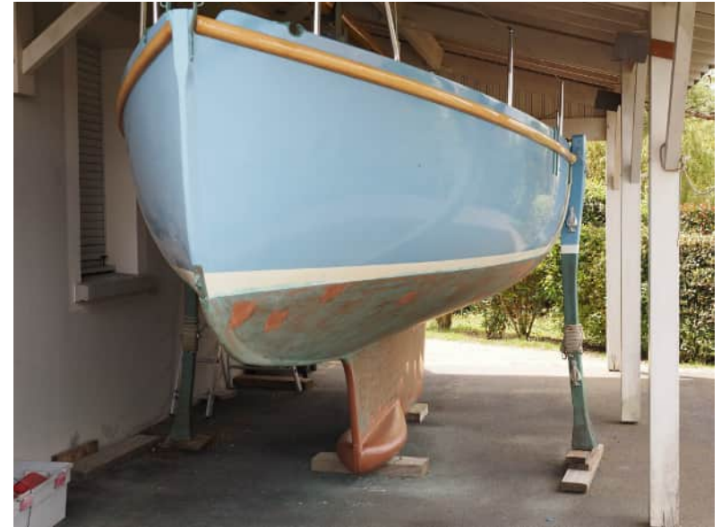
Pen-Hir #1 avant mise à l'eau 2024